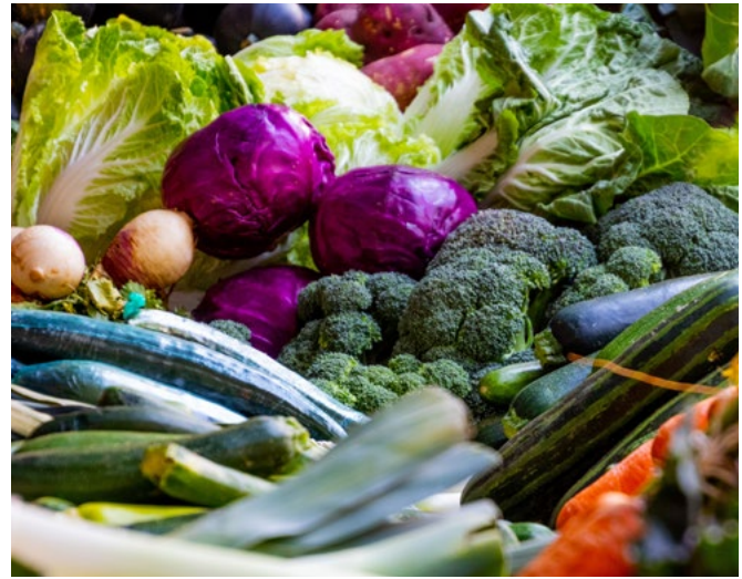
Vegetable seeds and plants available at ufseeds.com

Wyoming has quite the interesting range of